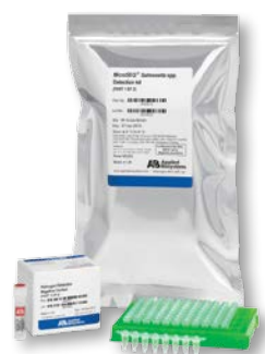
MicroSEQ® Salmonella spp. Detection Kit