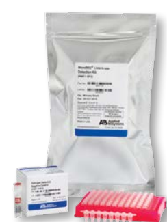
MicroSEQ® Listeria spp. Detection Kit

The RapidFinder™ STEC Detection Workflow is a complete, validated screening system for E. coli O157:H7 and the six non-O157 STECs. Developed in collaboration with the USDA, the RapidFinder™ STEC workflow detects the presence of multiple strains of E. coli in raw beef in as little as 10 hours, providing meat producers with a simple, accurate, and fast solution for efficiently responding to new screening regulations for these pathogens.