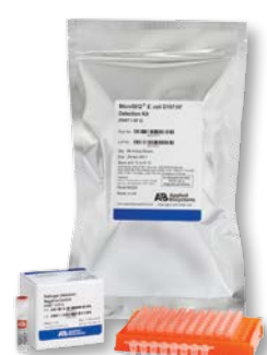
MicroSEQ® E. coli O157:H7 Detection Kit