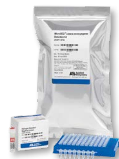
MicroSEQ® Listeria monocytogenes Detection Kit